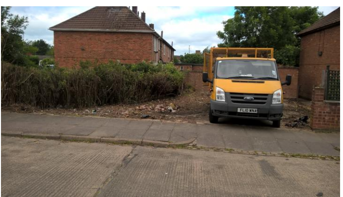
If you have any issues that you would like to report then please speak to the City Wardens or contact the service on www.leicester.gov.uk/myaccount