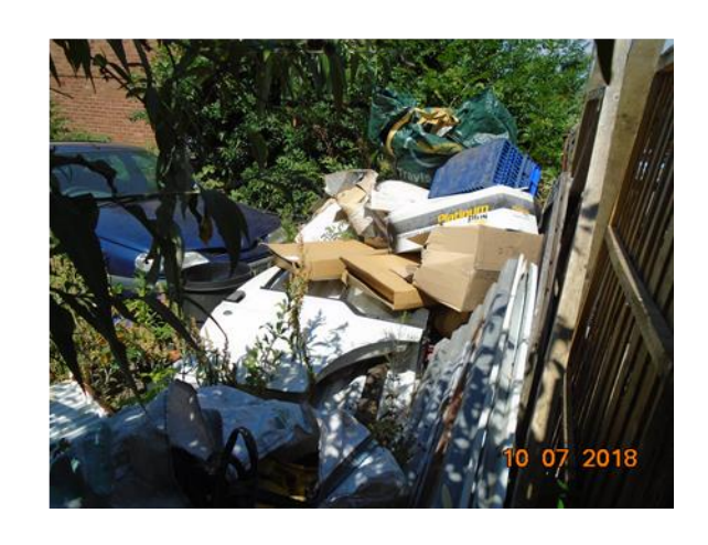
After photographs of site....